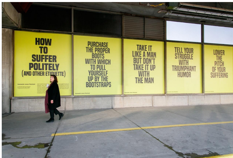
How to Suffer Politely (and other Etiquette) , a solo public installation as part of the VOLTA Art Fair (NY) presented by the Museum of Contemporary African Diasporan Art (2016), 10' x 9.6' Vinyl

Some of the first stuff that I started to record were people doing street sermons. I wanted to understand the landscape of New York through sound, and what it means for people to declare religious ideas in public spaces, and to have an audience for that. My research can look like just basic sitting and observing. It can look like me going up to a street preacher and asking questions. It can look like me going to the library.