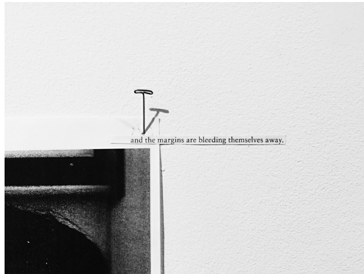
Detail image of On Refusal , a solo installation as part of the Fellowship program at A.I.R. Gallery in Brooklyn, NY (2016). Materials include xeroxes, fabric, monoprints, found photographs, self-authored texts, text excerpts from a range of sources, video, and audio. The text fragment, 'and the margins are bleeding themselves away' is from August Kleinzahler's Ruined Histories .

I have a collection of pamphlets from people who did sermons both here and from South Africa. I have these 4,000 photos. I have different types of advertisements. I want what I've collected to be free, easily accessible, and mobile.