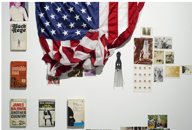
Detail image of No Instructions for Assembly , a solo installation at Real Art Ways in Hartford, CT (2016)

Now that I'm an adult, what's really interesting is thinking about the ways that I worked as a very young person, and how they're very similar to the ways I work now.